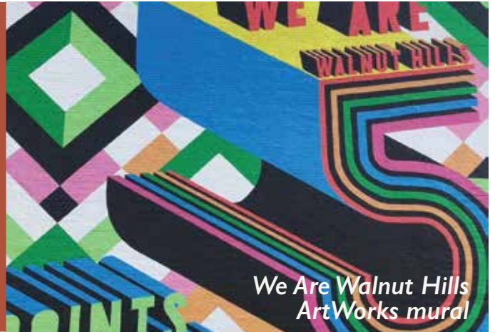
We Are Walnut Hills ArtWorks mural

ROOKWOOD POTTERY OTR High quality pottery goods since 1880